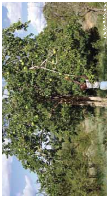
A boy picking indigenous fruits from a Strychnos spinosa tree (Kiwahili - mtonga, mpapa).